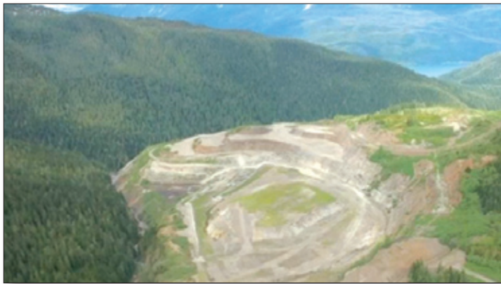
Fly thousands to your site and see the completed project