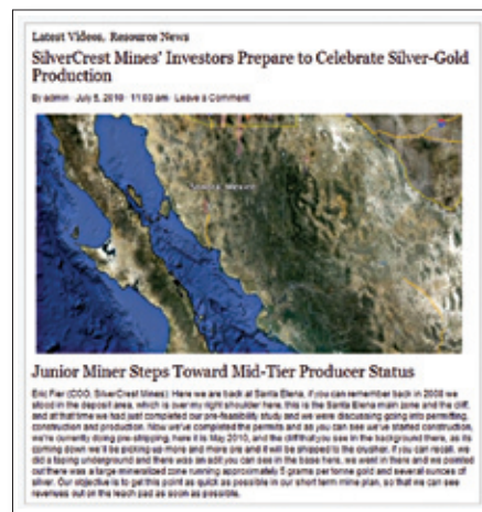
Still from the SilverCrest mines video.

Story on resourceINTELLIGENCE.net and in Resource Intelligence's RI Analytics Profile for 12 months. Current audience 70,000 per month+. Posted to over 400 websites globally. Potential audience 1,000,000. 125,000 newsletter subscribers.