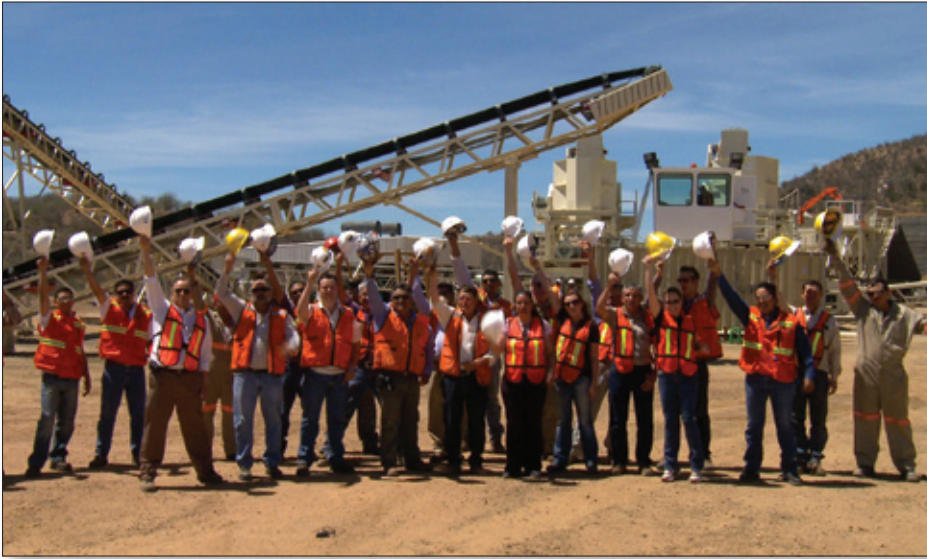
Celebrating the on-time, on-budget completion of construction.

To most cameras, rocks are rocks, holes are holes — but not with Resource Intelligence. We add believability. We capture the promise of the company and the passion of its people.